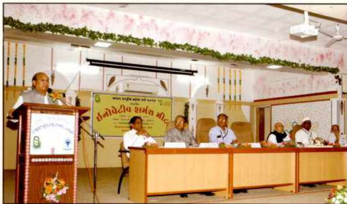
Innovative Farmers Meet-2016