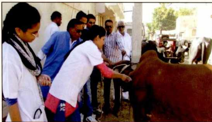
Veterinary Clinical Camps

Special Veterinary Clinical Camps were organized by CoVS&AH, JAU, Junagadh at Rajkot on January 10, 2016 in collaboration with Shri Panchnath Mahadev Sarvajani Trust, Rajkot; At Amarapur (Gir), Ta.Malia Hatina on January 22, 2016 in collaboration with Sadbhav foundation, Junagadh; At Taravada, Dist. Amreli on February 24, 2016 in collaboration with College of Agriculture, Amreli; and at Vekari, Dist. Junagadh on March 27, 2016 in collaboration with AhirKarmachari Mandal. Total of 1746 animals were treated for different medical, surgical and gynecological ailments.