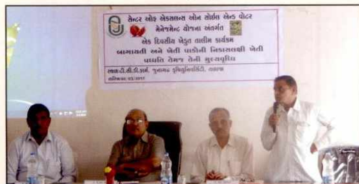
Training programme on “Export Related Cultivation Practices of Horticulture & Agricultural Crop and Its Value Addition”