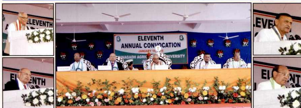
Eleventh Annual Convocation of Junagadh Agricultural University, Junagadh held on January 16, 2016