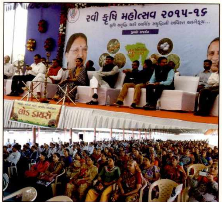
Celebration of Rabi Krushi Mahotsav 2016