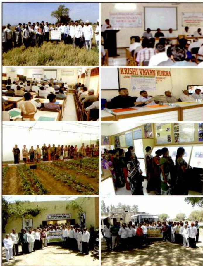
Various activities of KVKs