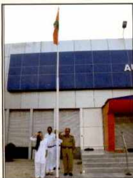
Celebration of Republic day on January 26, 2016