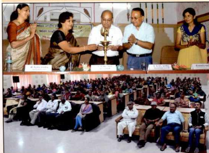
Inauguration ceremony of "Mahila Kaushalyavardhan Talim" on March 4, 2016 as a part of celebration of International year of Pulses – 2016 and International Mahila Day