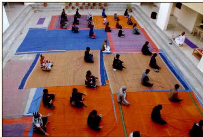
Yoga Shibir at PGIABM