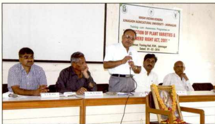
Awareness cum training programme on "PPV&FR Act- 2001"