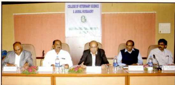
VCI Team visited CoVS&AH, JAU, Junagadh