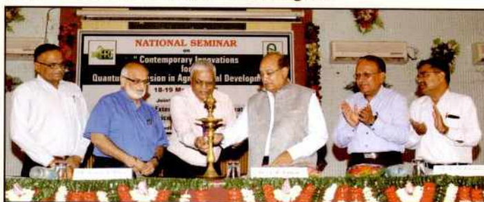
Inauguration of National Seminar on "Contemporary Innovations for Quantum Extension in Agricultural Development"