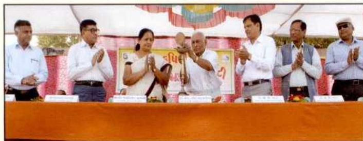
Inter College and Inter Polytechnic Athletics meet 2016