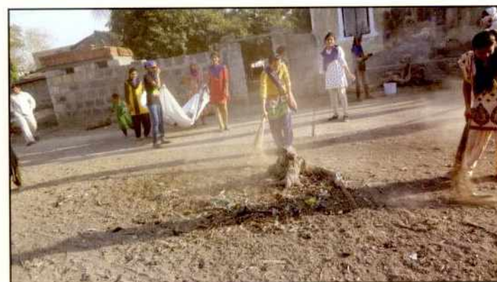
Swachchhata Abhiyan by NSS students at Goladhar from March 15-21, 2016