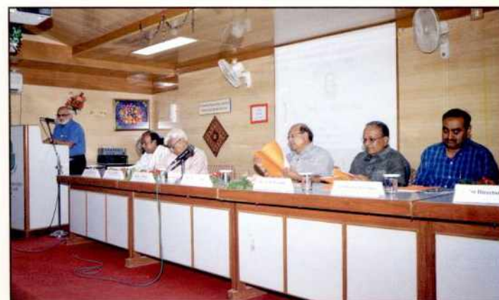
Joint AGRESCO Meet