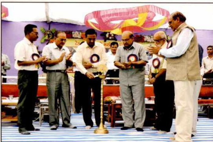
Technology and Machinery Demonstration Fair