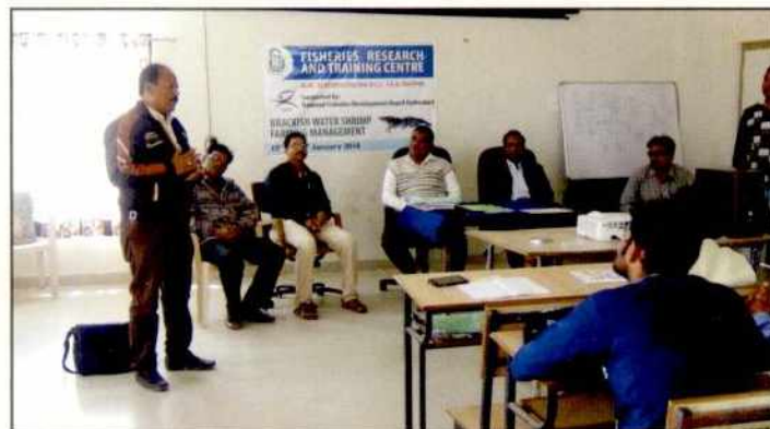
Training program on "Brackish-Water Shrimp Farming Management"

Five days training programme on "Brackish-Water Shrimp Farming Management" was conducted by the Fisheries Research and Training Centre, JAU, Mahuva in collaboration with NFDB, Hyderabad during January 18-22, 2016, wherein 20 participants from local fishermen community, private entrepreneur, attended the training. Expertise lectures were delivered by the faculty from College of Fisheries, JAU, Veraval, Fisheries Research Station, JAU, Sikka and Okha, experts from CMFRI, MPEDA and NABARD bank, Bhavnagar during this training programme.