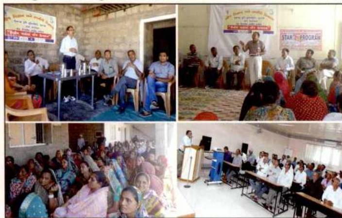
Farmers' Training on "Kshetriya Pakoma Bij Utpadan"