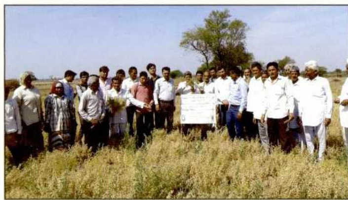
Field Day at village Oliya