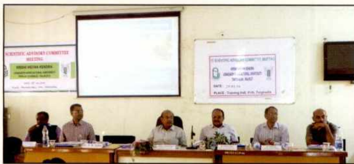
SAC Meeting at KVK, Targhadia on January 29, 2016