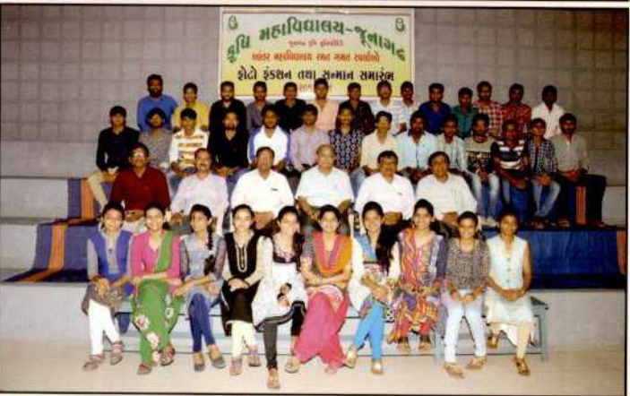
Felicitation of winners of Intercollegiate Sports competition of JAU