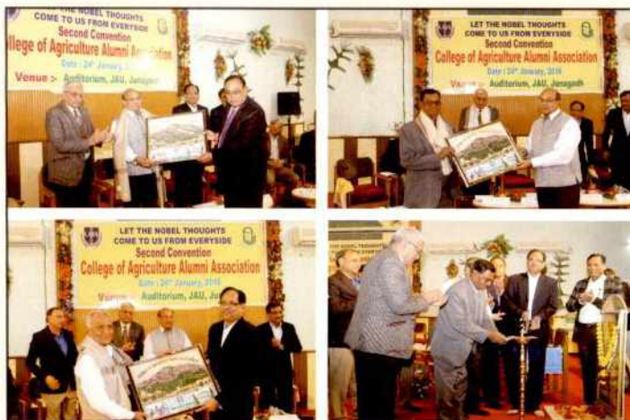
Second Convention of CAJ Alumni Association