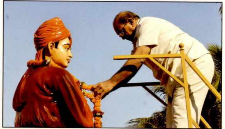
Youth Day Celebration (Swami Vivekanand Jayanti) on January 12, 2016