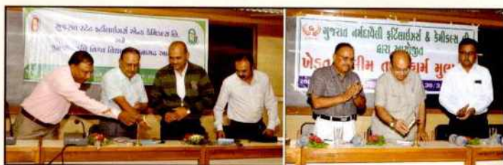
Farmers Training Programmes with GFFC (January 27, 2016) and GNFC (March 30, 2016) by SSK

Total 10 (Ten) Training Programmers (On-campus) were conducted by the Sardar Smruti Kendra during January to March, 2016, wherein 418 farmers and 109 farm women participated from all over Gujarat.