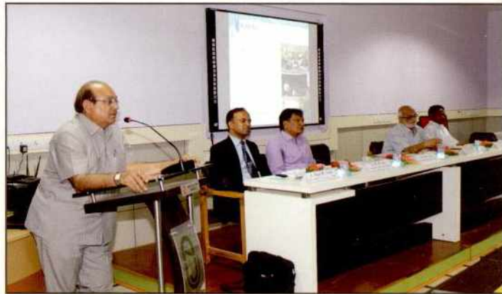
Seminar-cum-Training on "Campus to Corporate (C2C)"