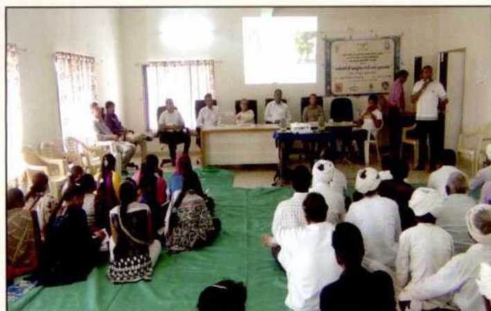
Farmer training programme on “Modern cultivation of coconut and its value addition”